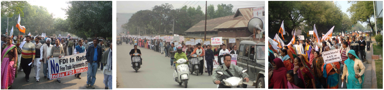
Protests against the EU-India FTA, India, December 2010

In December 2010, more than 200 civil society organisations from Europe and India called for an immediate halt to the negotiations until all negotiation texts have been published, the privileged access of big business to the talks has been ended and broad consultations with the most affected groups in India and Europe have taken place (see box on the previous page). Their concerns were echoed in a letter from 25 MEPs to EU Trade Commissioner, Karel de Gucht 10 .