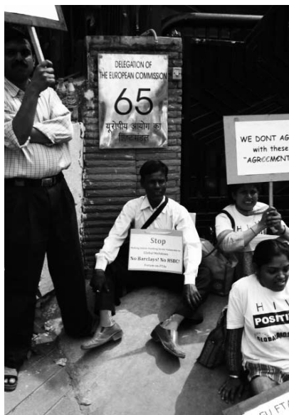
Protest at the EU delegation in Delhi in March 2009: we don't agree with these 'agreements'