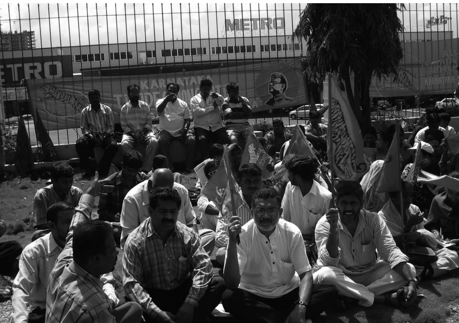
Protests against the opening of a Metro store in Bangalore in 2007

Demands by Indian civil society, Members of the Parliament and some state governments to limit the super-market expansion and defend the interests of smaller retailers, which have been repeated by European development groups including ActionAid, Traidcraft and Oxfam, have seemingly been ignored 130 .