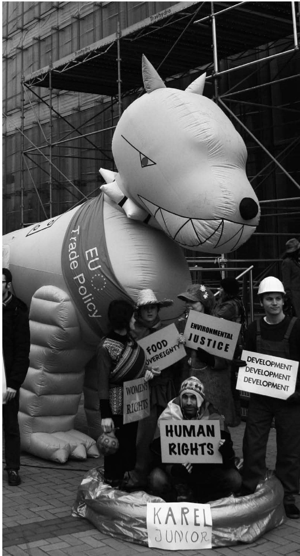
European trade activists protest against the EU corporate trade agenda in front of DG Trade's headquarters in Brussels, March 2010