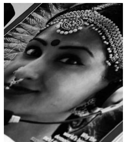
India – country of contrasts