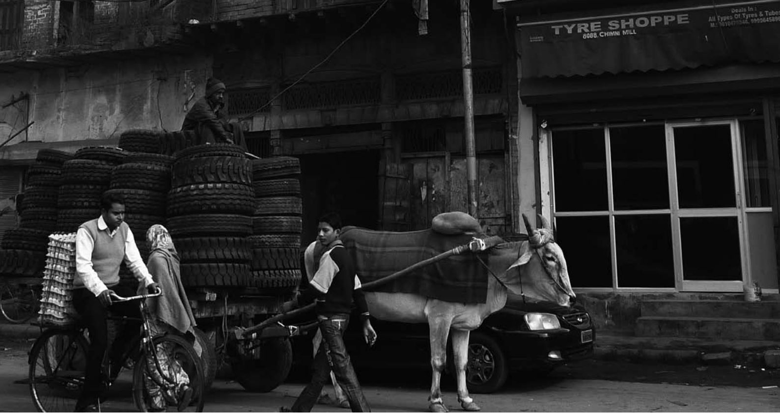
Will this tyre shop soon sell only Continental, Michelin or Pirelli tyres?