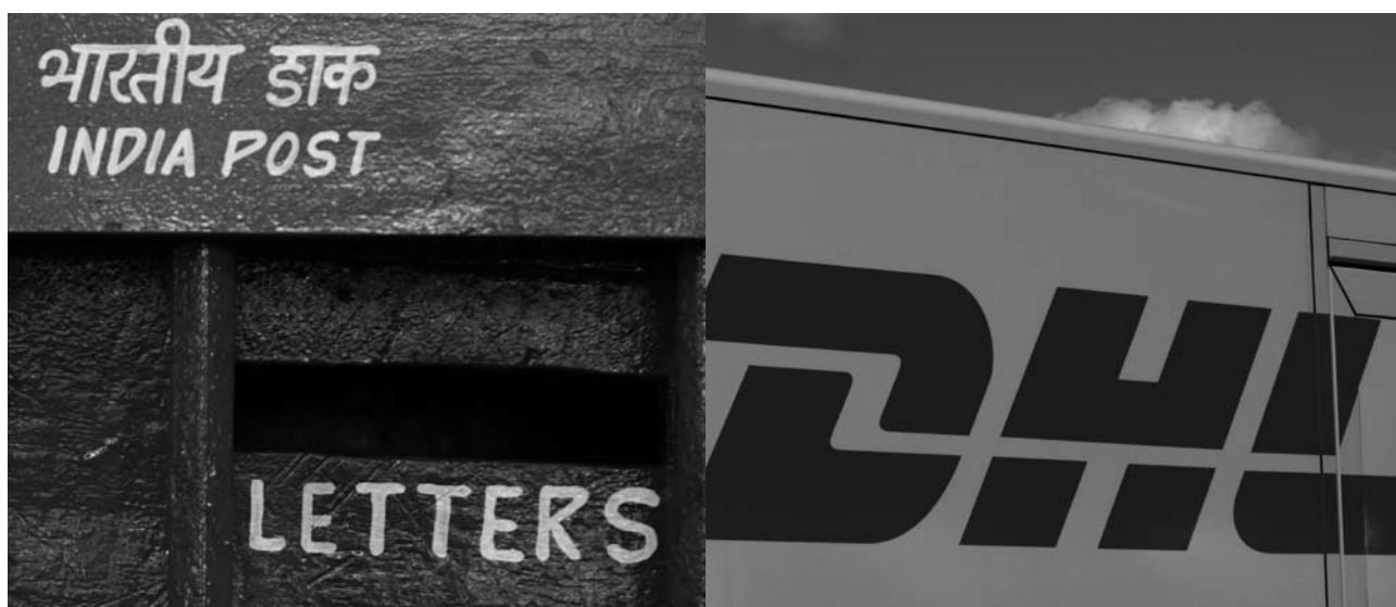
India Post or DHL – who will deliver mail to India's tribal people?