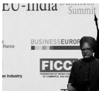
Prime Minister Dr. Manmohan Singh addresses the India-EU Business Summit in Paris, September 2008

The group's 2006 report contains far-ranging liberalisation 'recommendations', several of which were clearly penned by industry. In its FTA position paper, CII, for example, advocated tariff cuts for "90% of traded goods" 149 . This was repeated by the HLTG, which approved the elimination of 90% of all tariffs in the EU and India within a period of only seven years. The group also recommended substantial services liberalisation, improved market access for foreign investors, the free repatriation of their profits, talks about liberalising government procurement markets and the protection and enforcement of IPRs 150 . With up to a quarter of the seats on the Indian HLTG delegation, CII and FICCI were well positioned to put these issues across 151 . No wonder, they considered their involvement "very important" 152 .