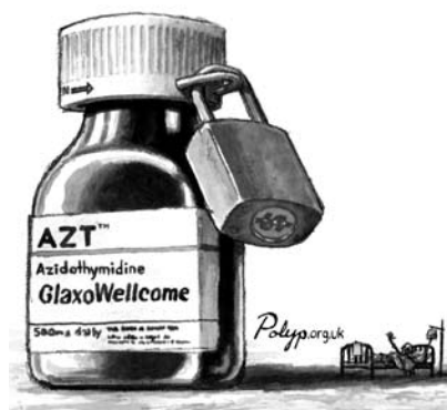
Cartoon: Polyp, www.polyp.org.uk , www.speechlessthebook.org

LOON GANGTE, DELHI NETWORK OF HIV/AIDS POSITIVE PEOPLE (DNP+) 87