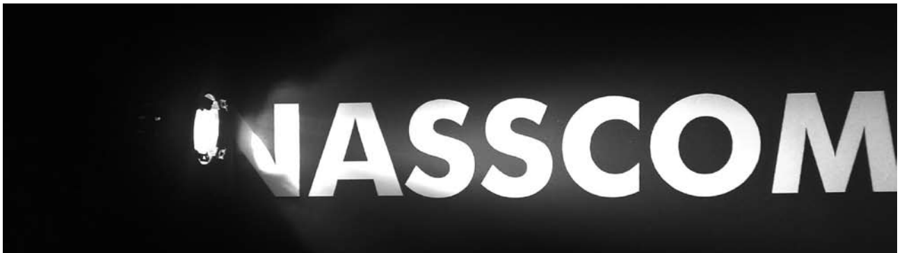
The Indian IT lobby – a lobby giant in the Brussels bubble?

The lobby strategy seems to have been successful. In an exclusive evening event