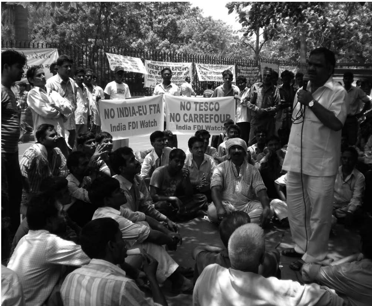
Street vendors protest for livelihood security and against the EU-India FTA, Delhi, June 2010