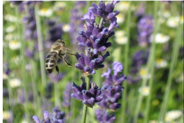
Bee foraging nectar and pollen from lavender

The presence of neurotoxic pesticides in food and water sources affects all the individual bees in the hive. As well as their direct toxicity for bees and the brood, sub-lethal concentrations of pesticides affect bees' nervous systems, altering their memory and learning abilities, disabling their sensitivity to stimuli, hindering communication and damaging their sense of orientation. The effect on the bee is similar to the effect of alcohol on humans. It affects the way in which the colony can defend itself against other damaging factors.