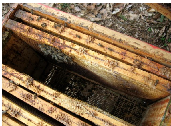
Suspected case of Colony Collapse Disorder: bees have abandoned the hive.

This working group included representatives of BASF, Bayer Crop Science, and Eurofins GAB; as well as representatives from the British and French food safety agencies FERA 13 and ANSES 14 , and the Julius Kühn Institute from Germany.