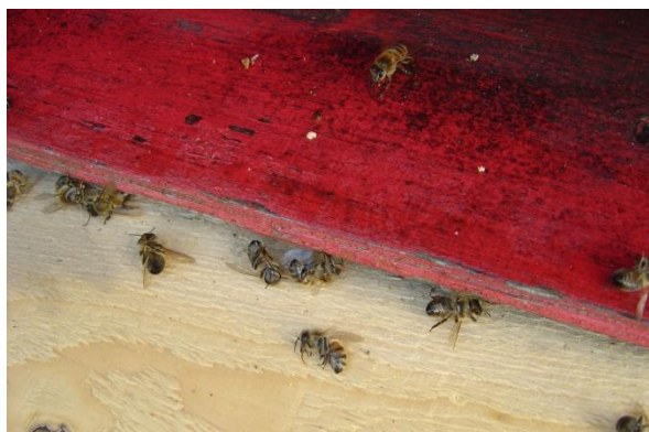
Observation of the hive in the early morning: dead bees in front of the hive entrance

However, this process appears to have been hijacked by the pesticides industry. The European institutions and the Commission in particular, rely on over a thousand expert groups and advisory bodies in order to design new legislation. This system has acted as an open invitation for corporations to influence policies that affect them. Corporate lobbyists have found their way in many of the bodies relied on by the Commission, where they can influence and help shape legislation from the early drafting stages.