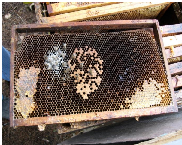
Frame of honeybee hive showing signs of Colony Collapse Disorder

Bee numbers have been declining over the last few decades as a result of various factors. In the past four years however, there have been inexplicably high death rates among honeybee populations, termed ‘colony collapse disorder’. Apparently healthy colonies suddenly collapse, sometimes leaving only the queen in the hive and abandoning the brood and their food reserves. Scientists are very concerned because of the vital role bees play in our food supply, with many food crops dependent on insects for pollination 2 . Many beekeepers are losing business but do not know what they can do to save their hives.